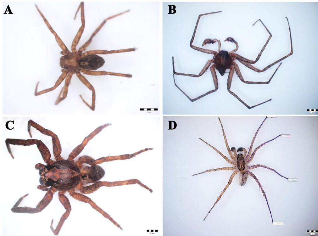
Fig.1: Spiders used in the prey preference test; (A) Female Heteropoda garciai (Bar = 2mm), (B) Male Olios mahabangkawitus (Bar = 2mm), (C) Female Ctenus floweri (Bar = 2mm), and (D) Male Pardosa apostoli (Bar = 2mm)